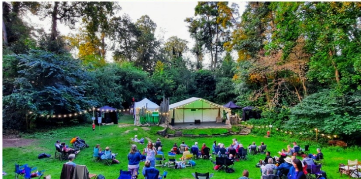
Hitchin Festival - The Dell at Woodside. Before and after.